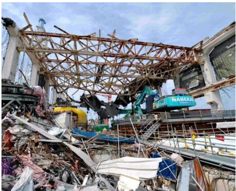
The fifth floor of the No. 4 reactor building at the Fukushima No.1 nuclear power plant as seen on May 26. The spent fuel rod pool is on the right, covered with a white tarp. (Pool)

"Pipes were severely bent," the reporter said. "Steel frames were also twisted and rusted. It was hard for me to believe such a