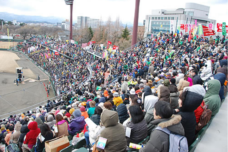
3/11 Good Bye Nuke Rally in Koriyama City, Fukushima Prefecture

reversed the current. The rally eventually adopted the rally's name "Good Bye Nuke Plants Rally."