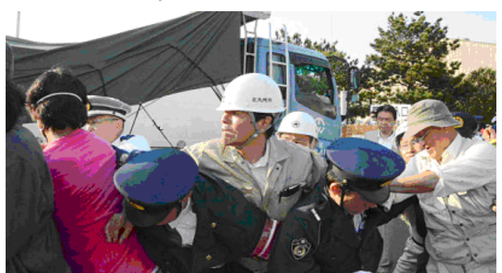
Direct action in Kitakyushu City on May 22 stopped debris carrying trucks for eight and half hours

At 9 AM, six trucks carrying contaminated debris arrived in front of the incineration plant. We immediately threw ourselves on to the trucks. Our car ran into a space between two trucks. The convoy came to a stand